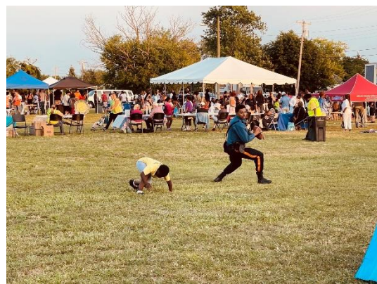
The Human Services Police joined National Night Out events in Ewing Township and Pleasantville, where they joined a football game with some children.