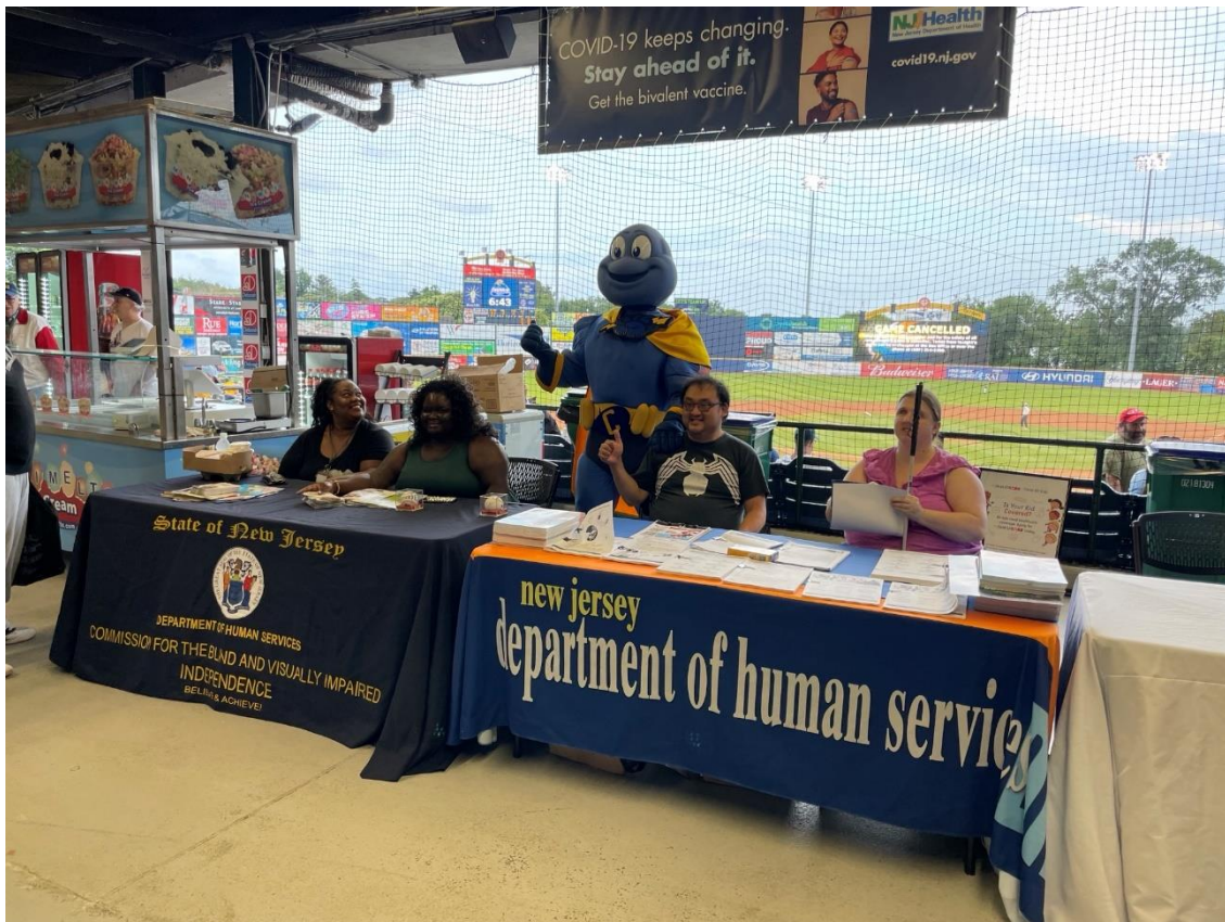
Celebrating the accomplishments of individuals who are blind, deafblind and visually impaired, the Commission for the Blind and Visually Impaired (CBVI) announced college scholarships to four blind, deafblind or visually impaired students, while also honoring four